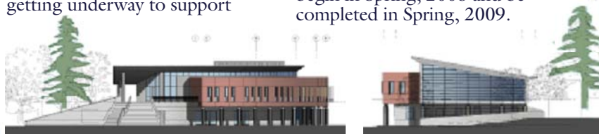
Drawings at left: south and northeast views. Top: east view.

The building's unique shape will lend to the architectural impact