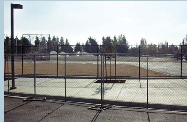
The soccer field is complete and the grass planted. All that's left to do is watch it grow!