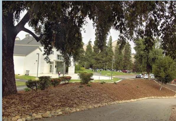
Landscaping improvements have been completed outside the Center for Microscopy and Allied Sciences (CMAS).

Citizens' Oversight Committee Meeting 5:30 pm in the Boardroom